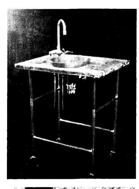
Fig. 5 A student in one of the author's environmental architecture courses built a movable sink from recycled plumbing, an old door, and an old bowl.